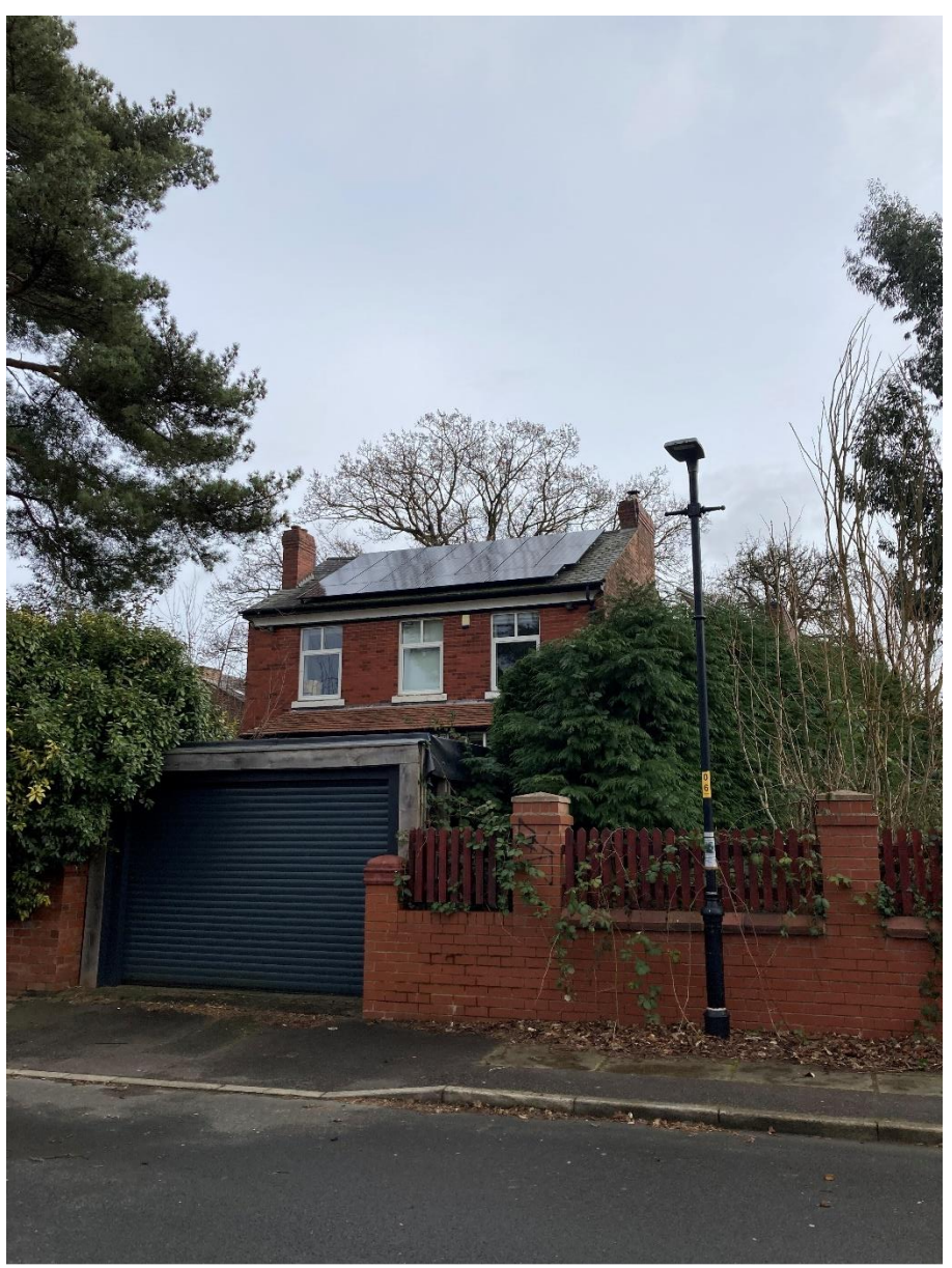
Oak tree canopy over roofline of property at 7 Brunswick Road

Following the making of a provisional TPO, 4 objections and 17 emails supporting the TPO have been received. A site meeting has been held with some of the objectors and the City Arborist to give advice on appropriate level of pruning works that could be supported.