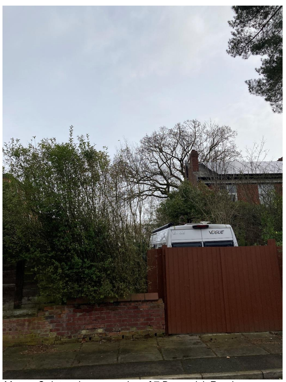
Mature Oak tree in rear garden of 7 Brunswick Road

The committee is asked to consider 4 objections made to this order and 14 representations in support of the TPO. This relates to a Tree Preservation Order (TPO) served at the above address on a mature Oak tree (T1) within the rear garden of 7 Brunswick Road, Manchester, M20 4GA.